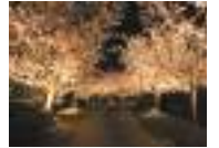
Sumaura Sanjo Yuen Park