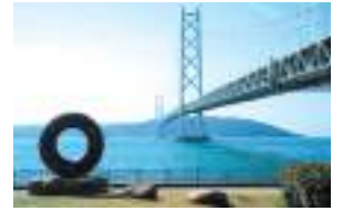
Akashi Kaikyo Bridge